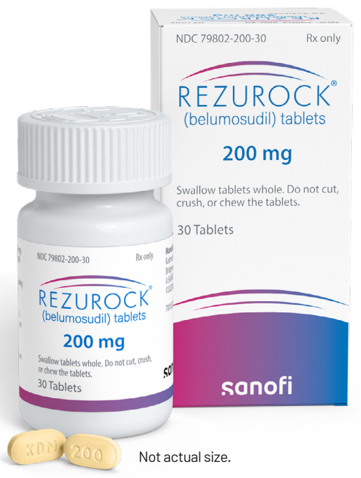
Side 1 Side 2

Do not change your dose or stop taking REZUROCK without first talking to your healthcare provider.